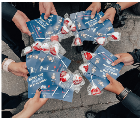
Our "Will you Police be our Valentine" event was a success! Lots of happy little ones!