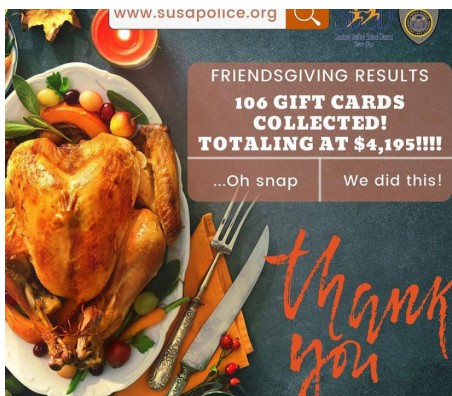
Over $4,000 in gift cards were donated during our Friendsgiving donation event!